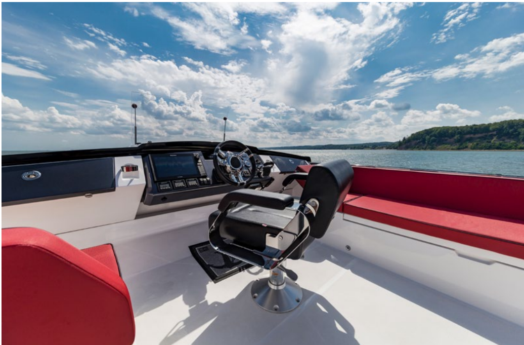
The top helm station allows for full control over the yacht —