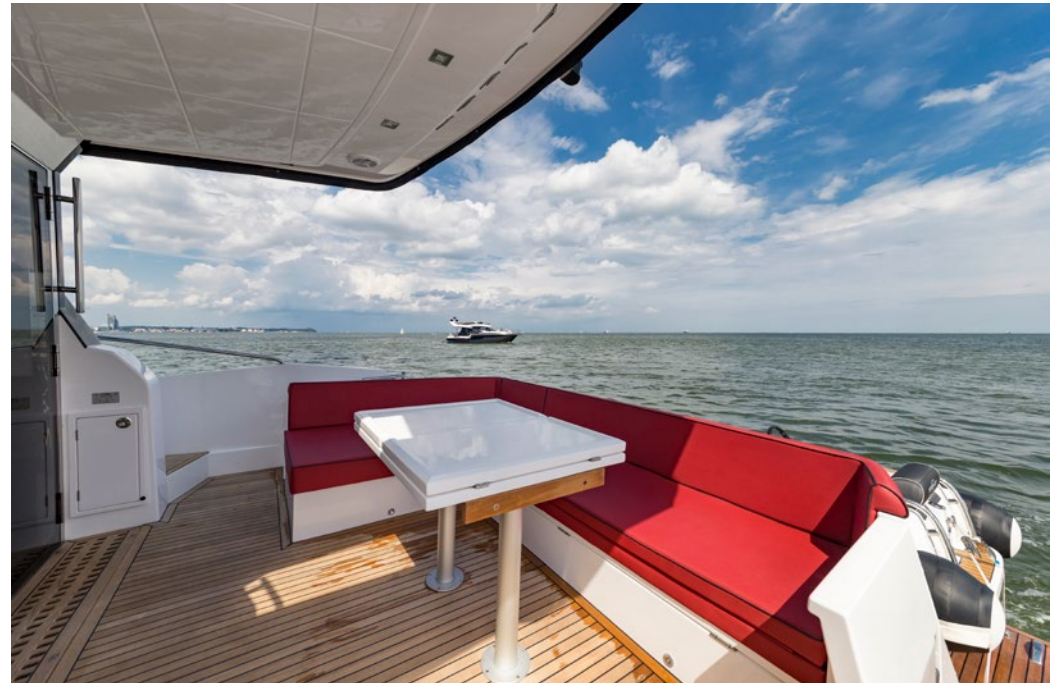
Cockpit leisure area with a table —