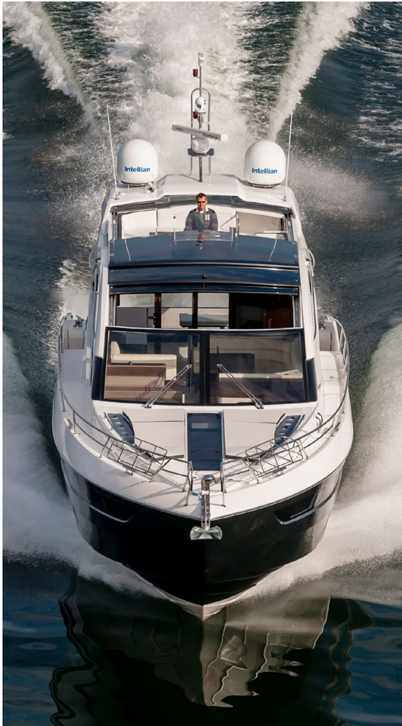
A stunning performer —