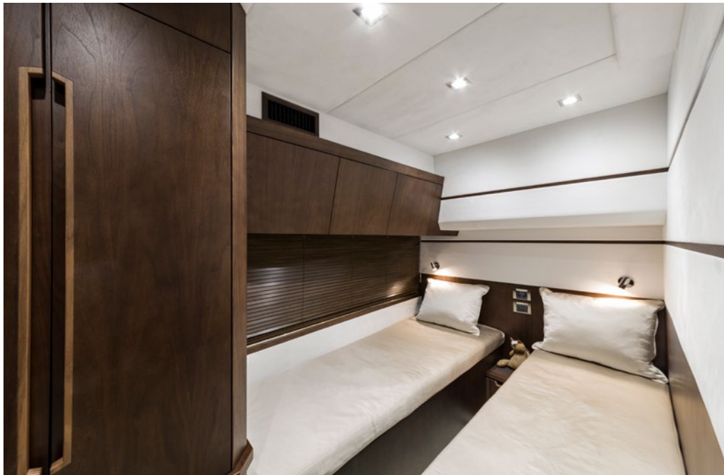
Twin beds in the guest cabin