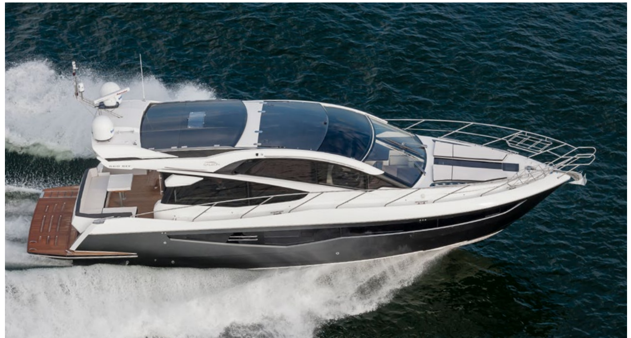
The top deck can be completely hidden away! —