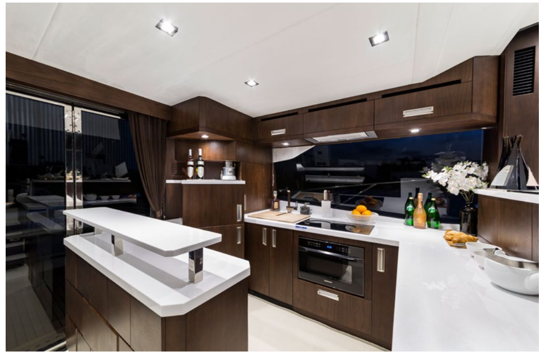
Find all the necessary equipment fitted