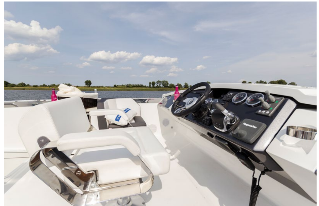
— Great visibility and full control from the top deck