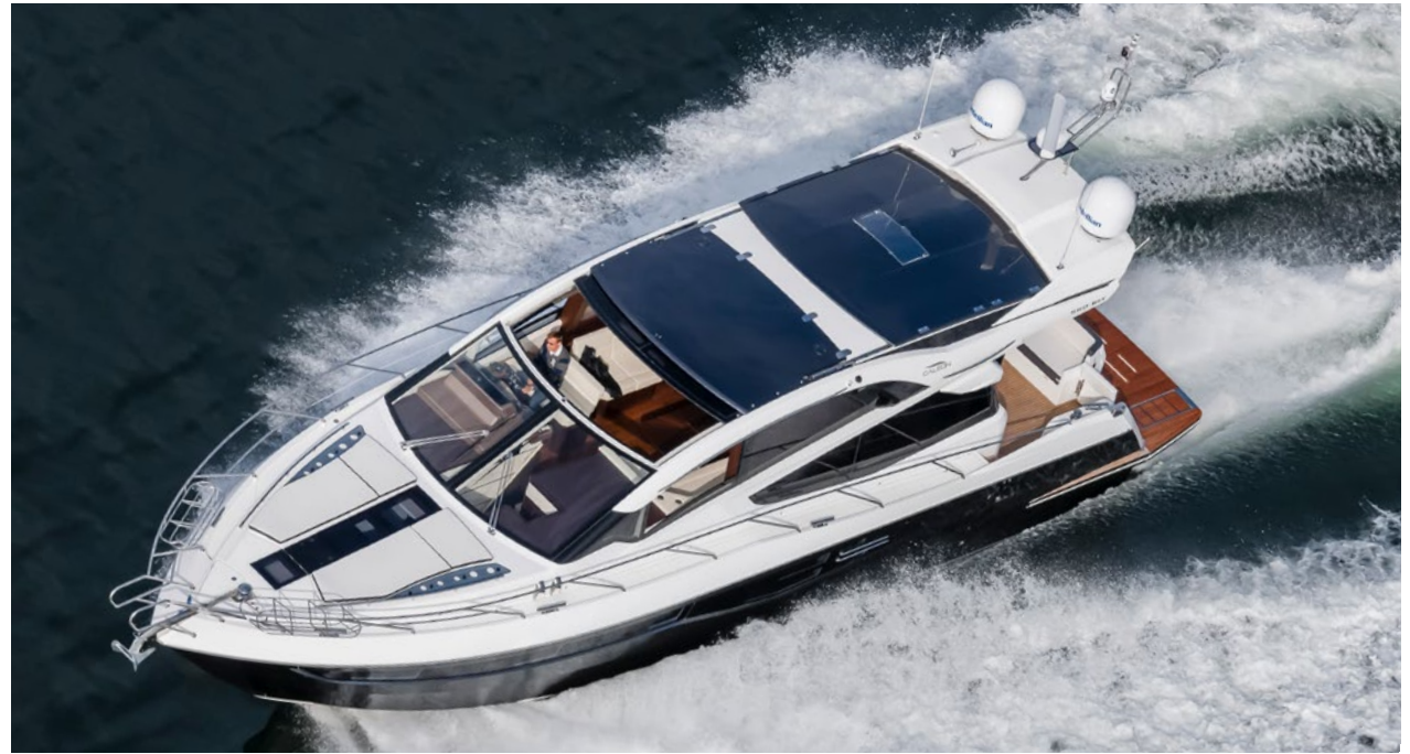
Open the sunroof even when cruising to air the interior —