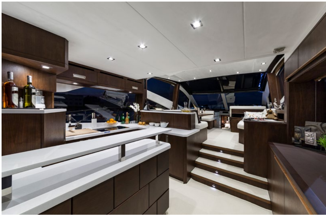
Kitchen area is moved back