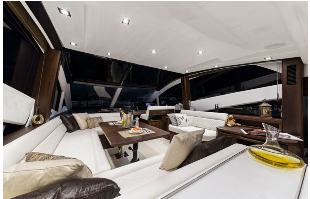
The forward facing rest areas