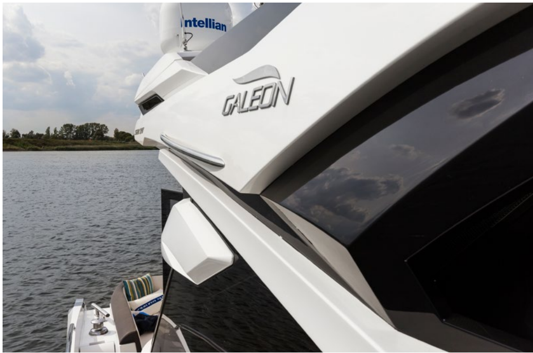
— The sleek and edgy design of the 560 SKYDECK