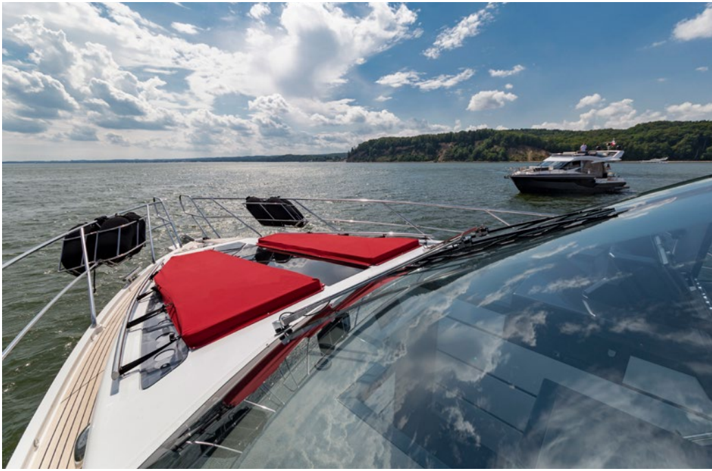
Bow rest area —