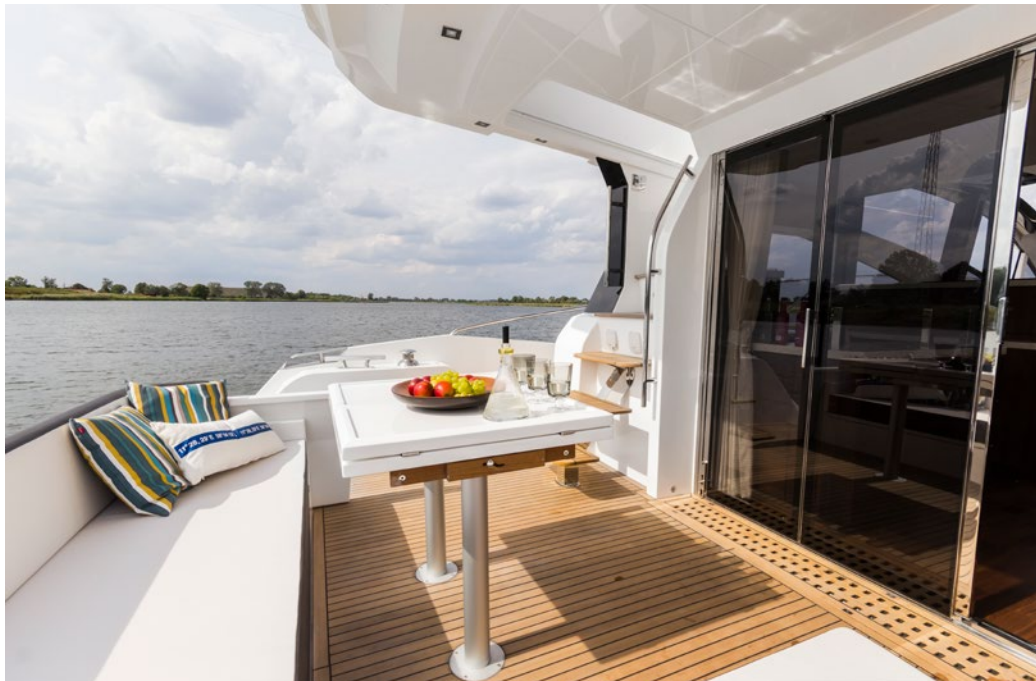
— Take respite in the cockpit area