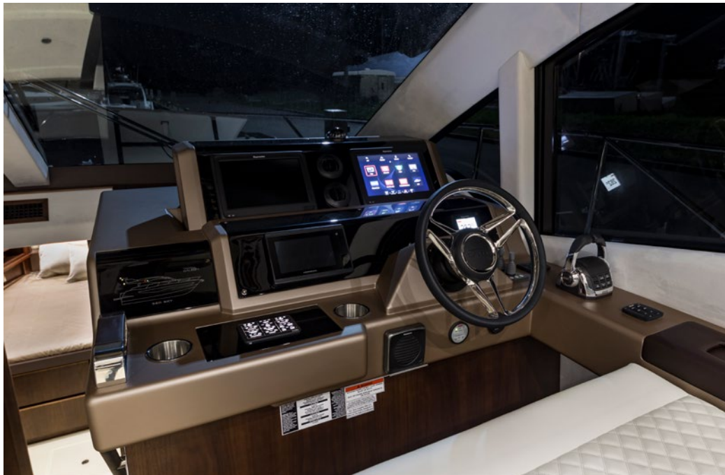
A high-tech helm station gives total control over the yacht