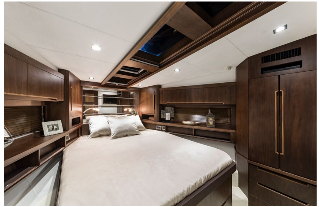
Forward VIP cabin