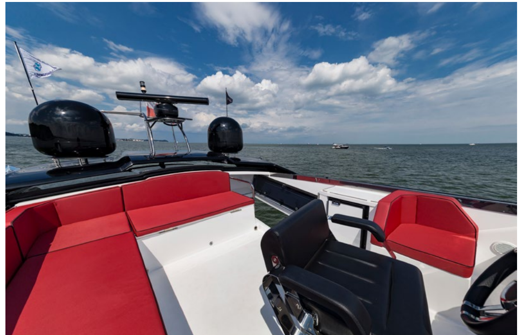
Quickly close off the SKYDECK when not in use! —