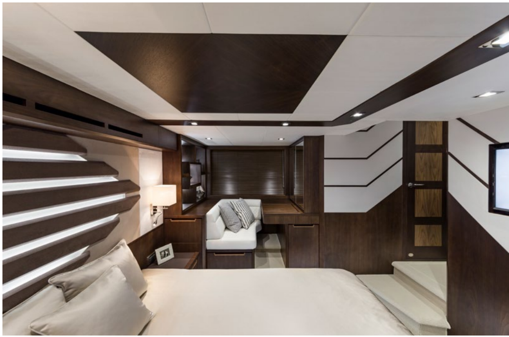
A rest and make-up area in the owner's cabin