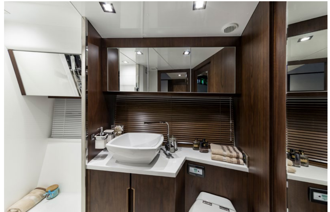
Ample bathroom space with separate shower