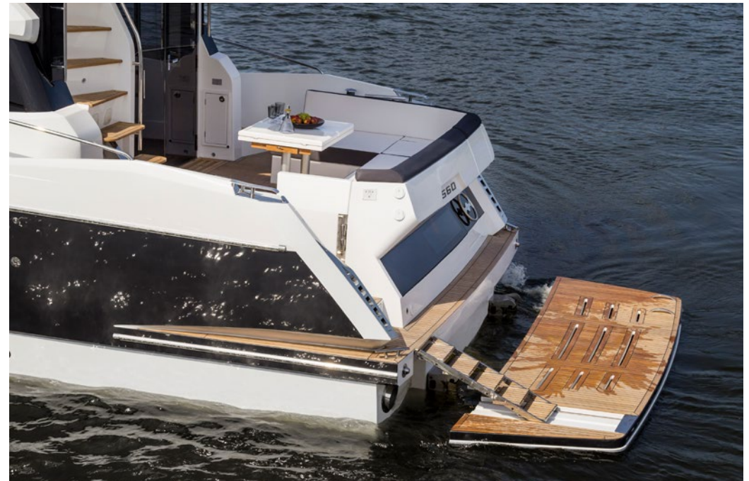
— A powerful hydraulic aft platform