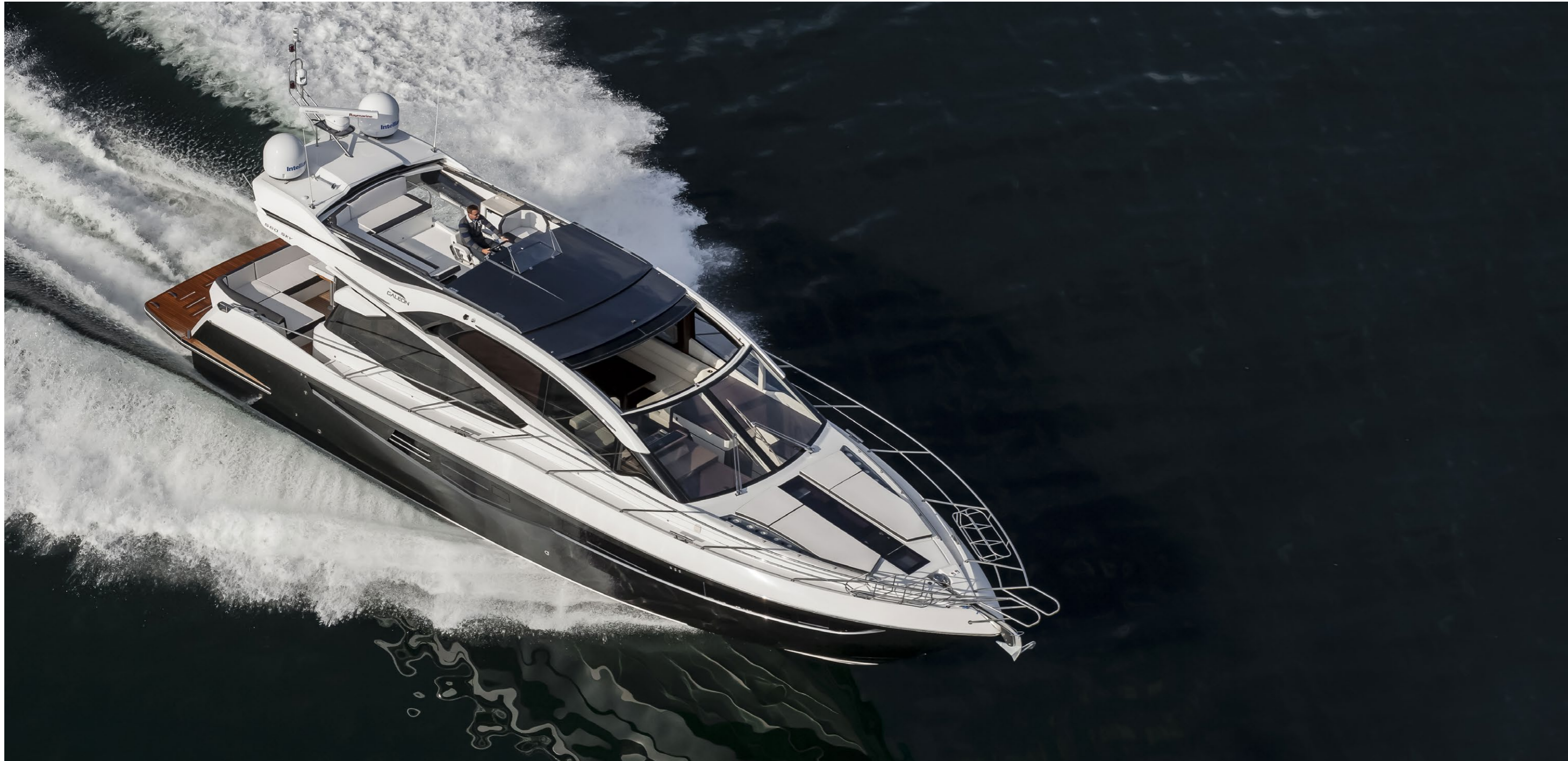
Control the yacht from the top deck steering station