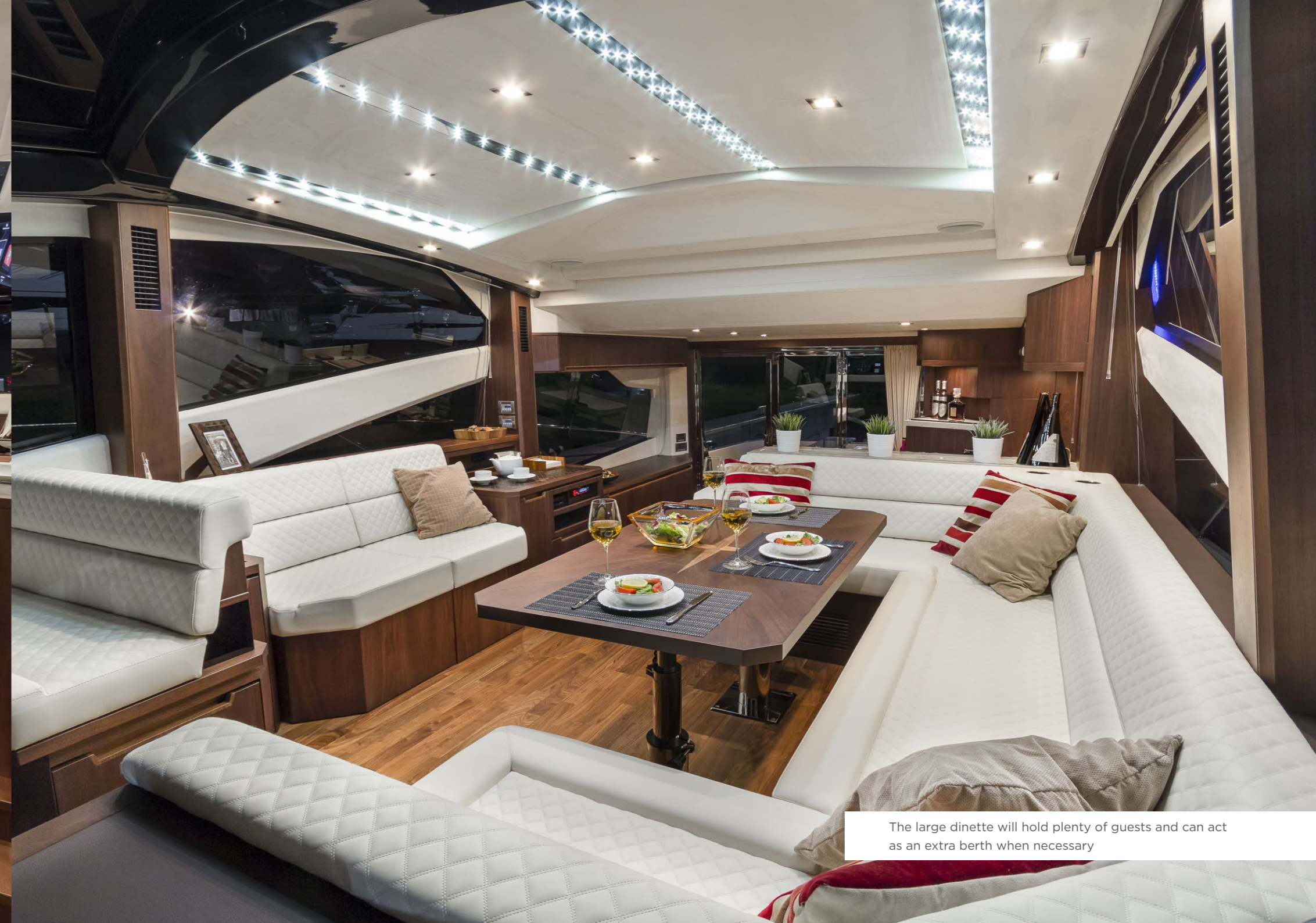
The large dinette will hold plenty of guests and can act as an extra berth when necessary