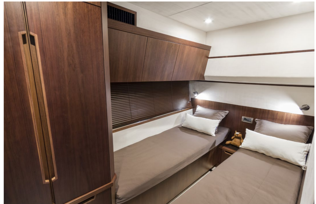
Beds slide together in the guest cabin