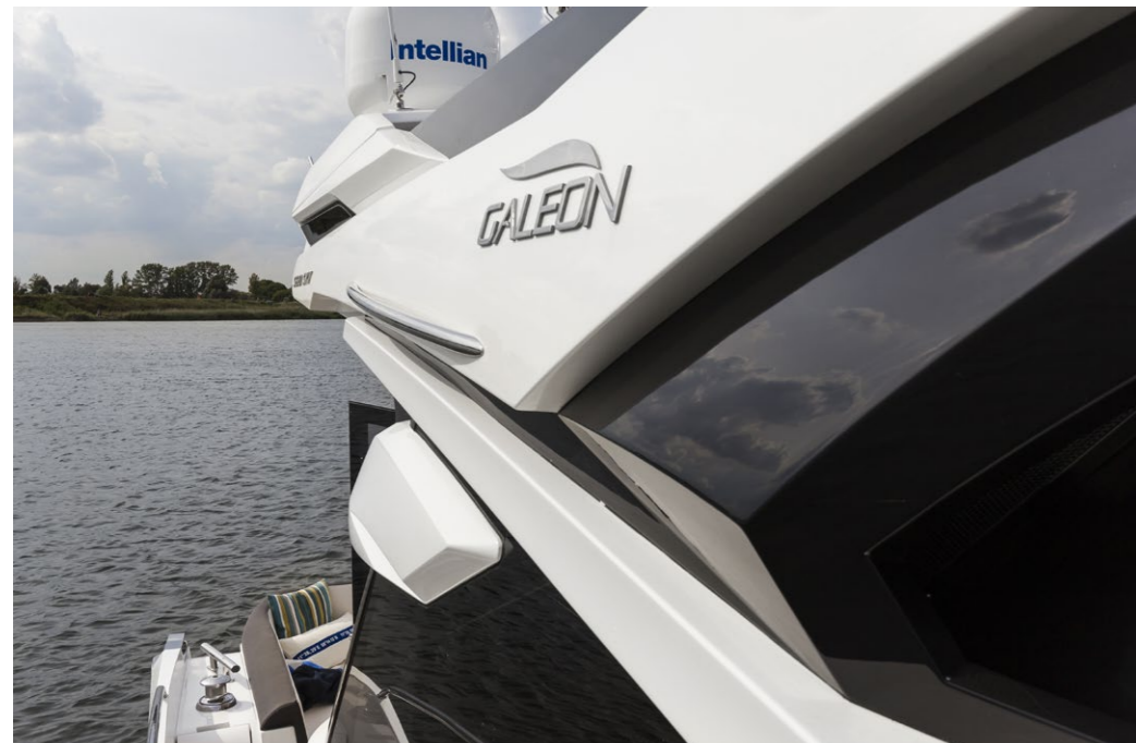
The sleek and edgy design of the 560 Skydeck