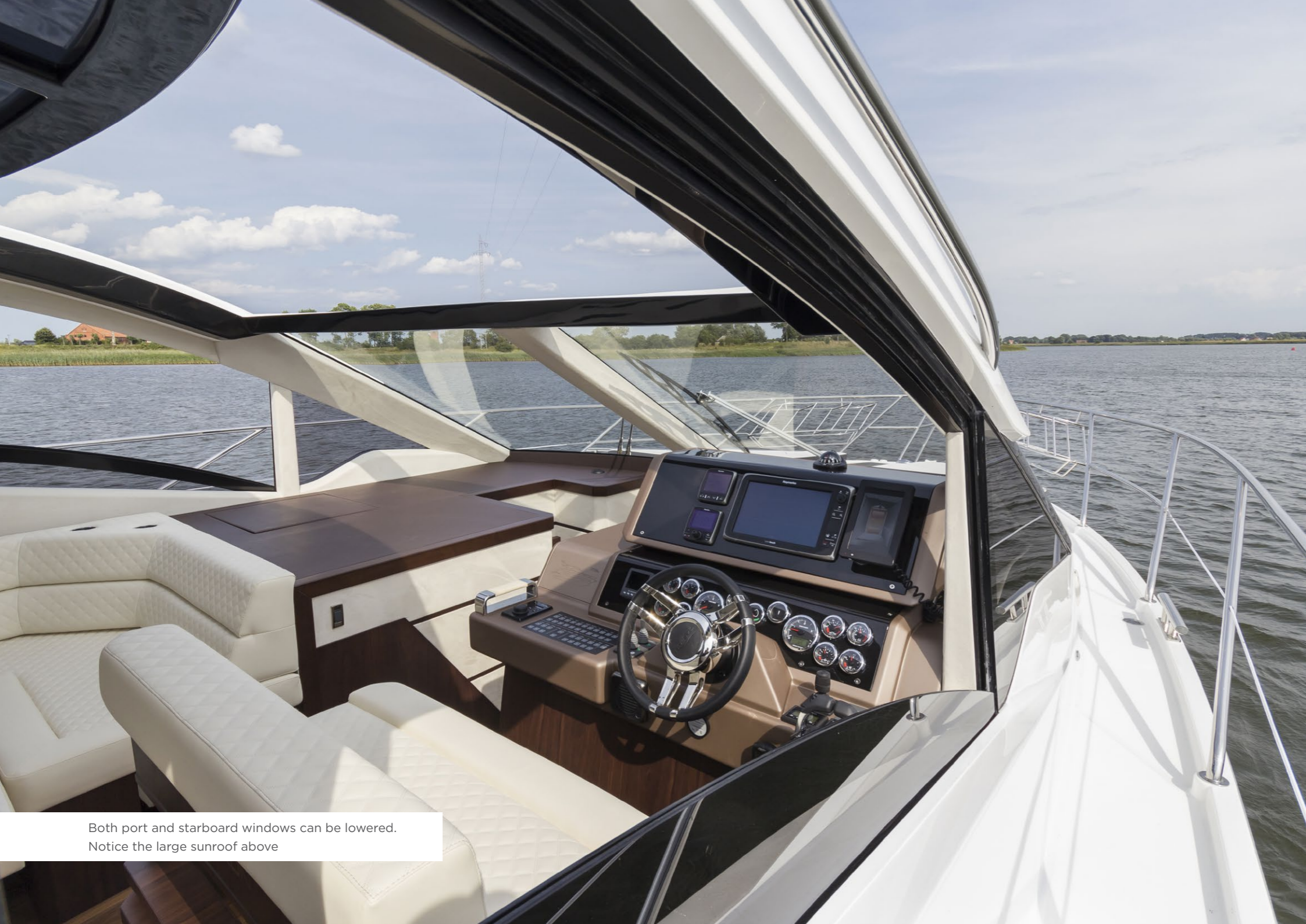
Both port and starboard windows can be lowered. Notice the large sunroof above