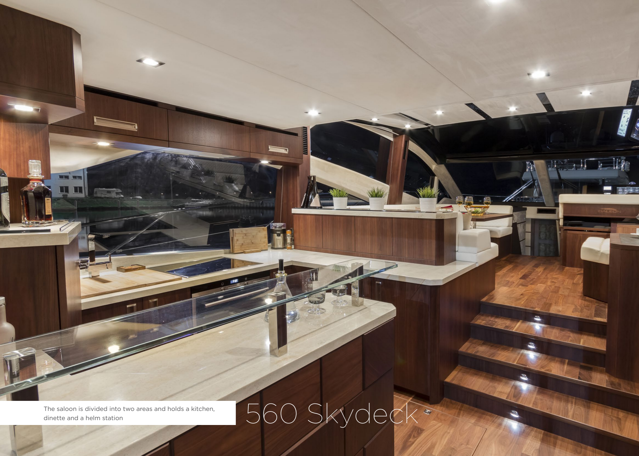
The saloon is divided into two areas and holds a kitchen, dinette and a helm station