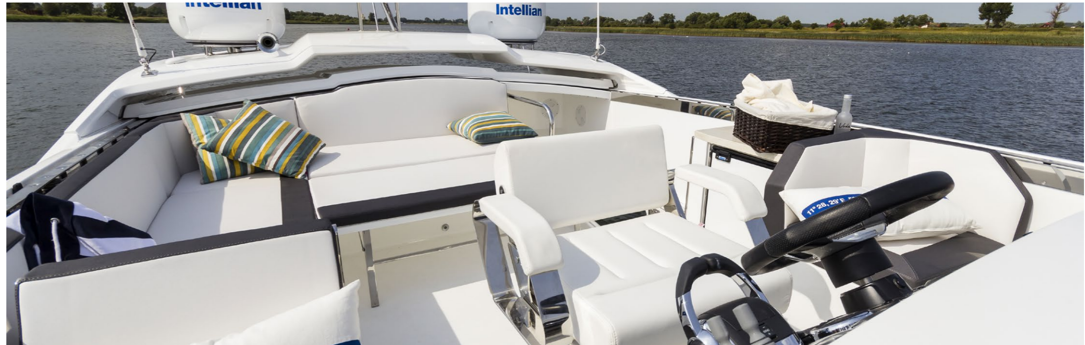
The whole Skydeck area can be closed off by an automatic laminate roof