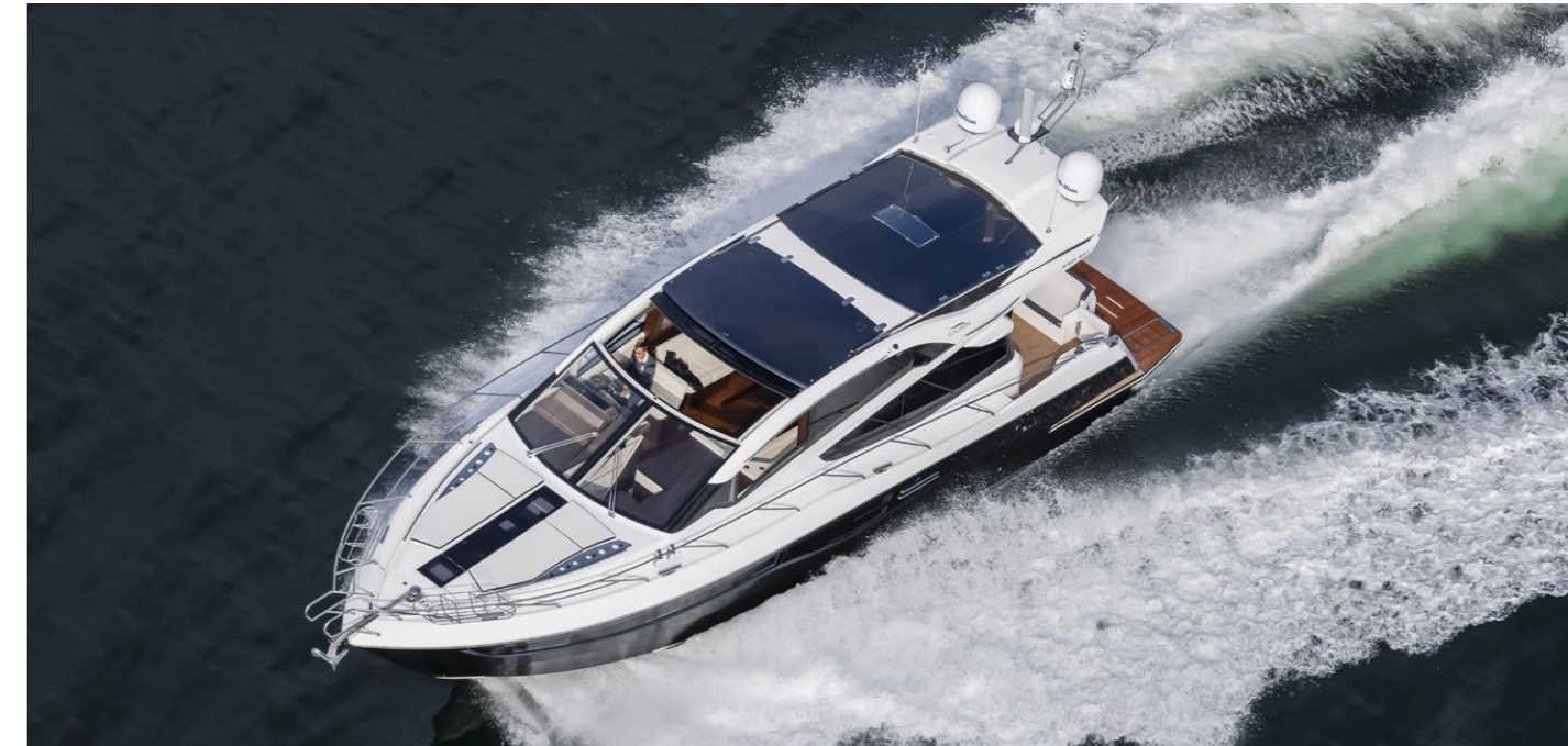
A large sunroof over the helm station