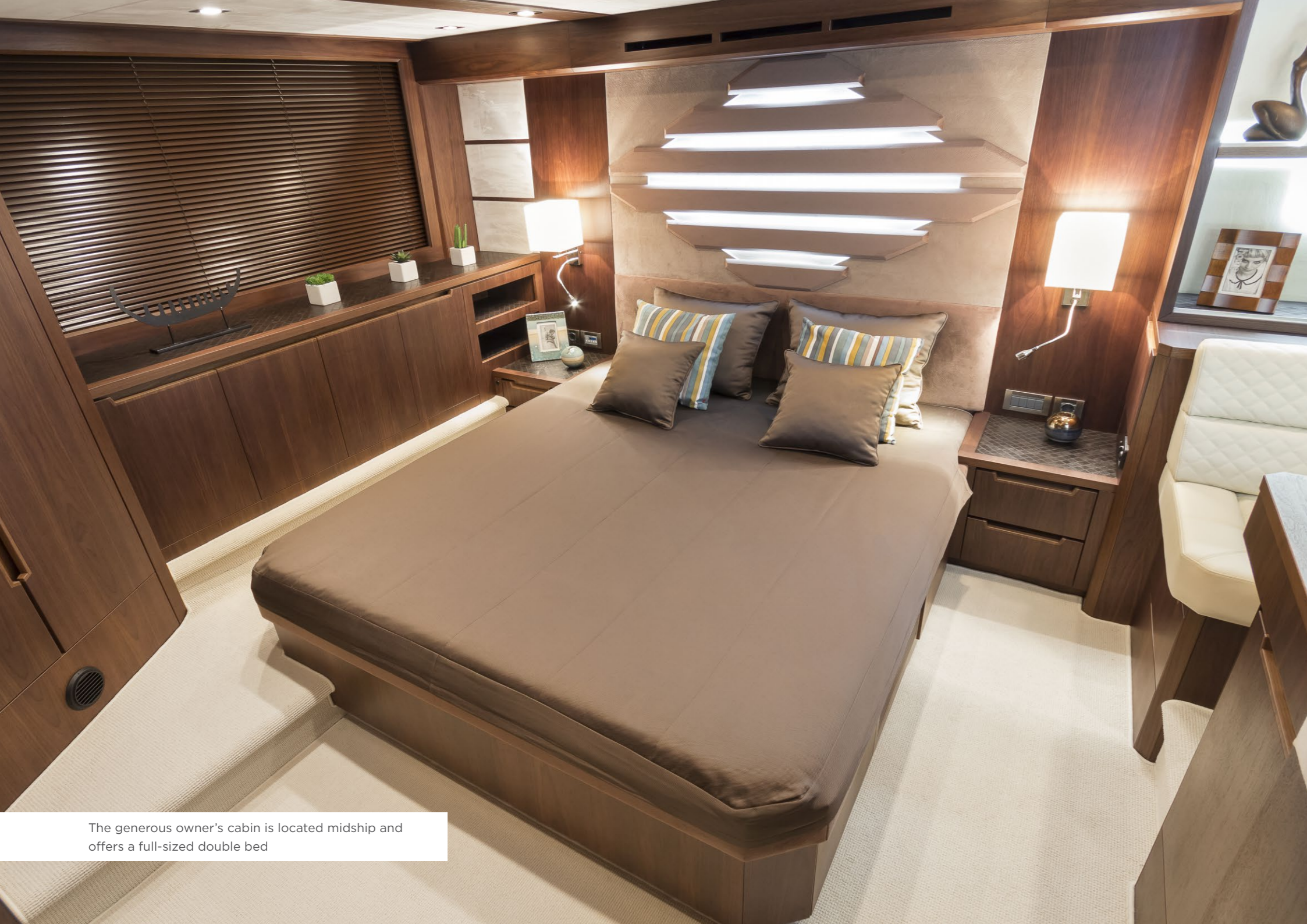
The generous owner's cabin is located midship and offers a full-sized double bed