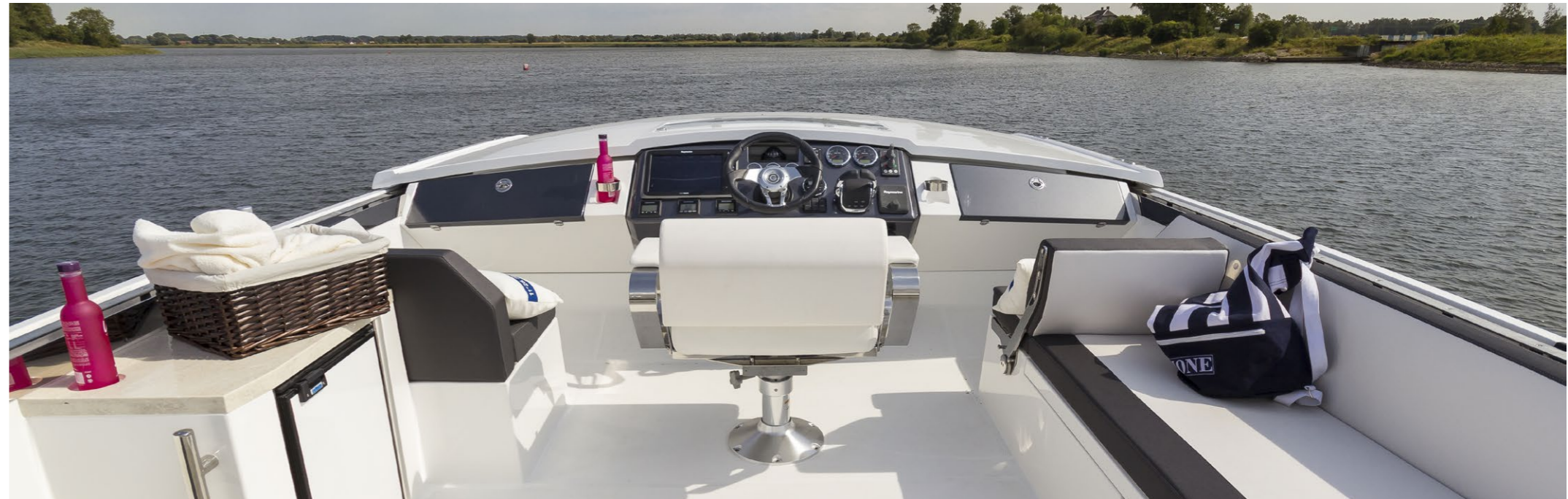
The console and wind protector will slide out automatically