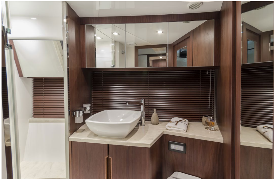
Comfortable bathroom with a separate shower