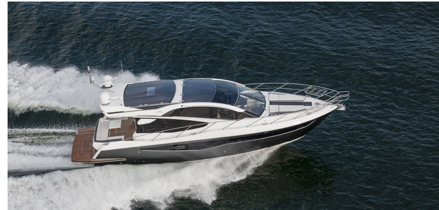
The top deck can be completely hidden away!